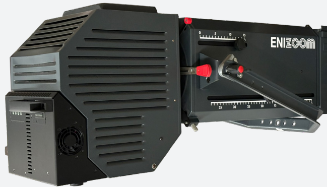
ReLite LED Kit FS6 for Eni Zoom 2K