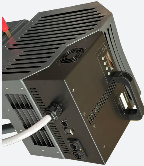
ReLite LED Kit FS6 for Eni Zoom 2K Rear Panel