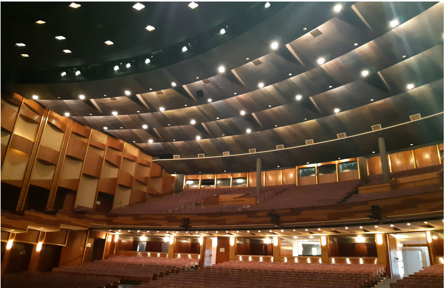
Theatre - Salzburg Festspiele Theatre, Austria