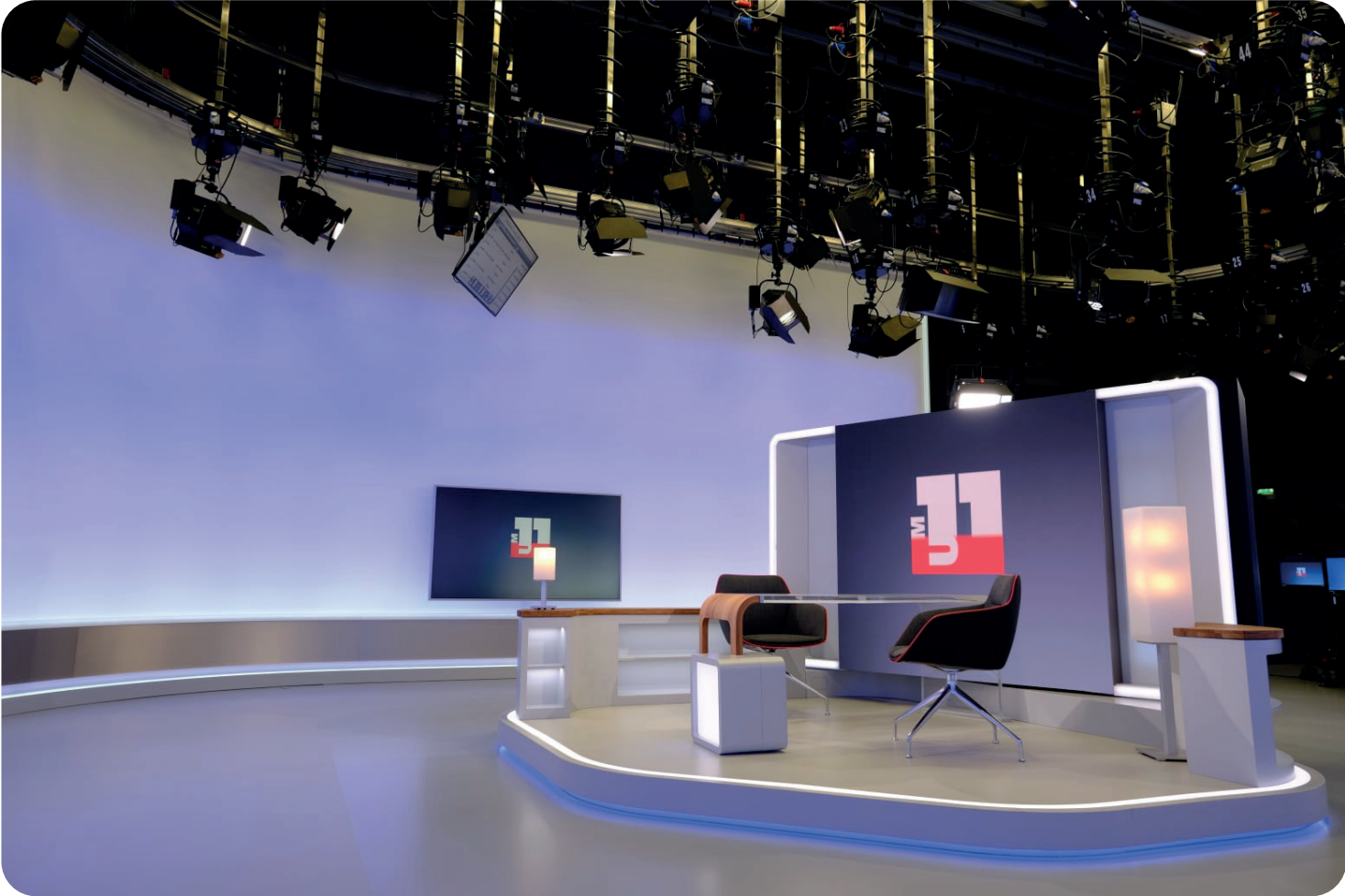
Broadcast - MDR Mitteldeutscher Rundfunk, Germany