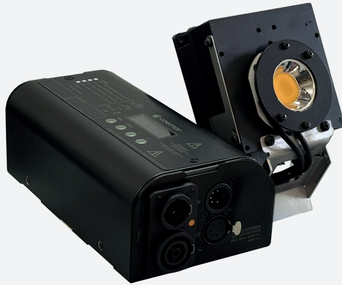
ReLite LED Kit for DeSisti Leonardo 1K